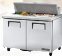
TSSU-48-12-HC *NEW HC energy efficient