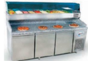
3 Door shown