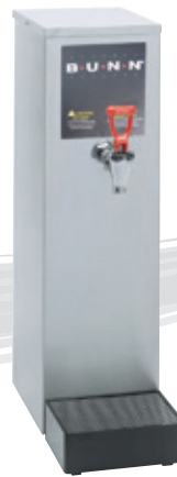
HW2 Hot Water Dispenser