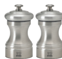
Bistro Chef Mills, Stainless 10cm - 4in Pepper 33033, Salt 33040