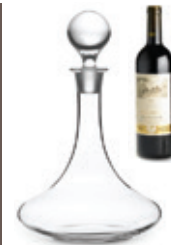
Capitaine, Decanter 230081 Mouth Blown