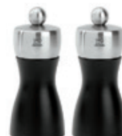
Fidji Mills, Black Set 12cm - 4.75in 2/21283