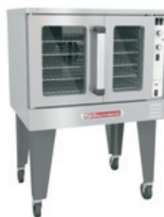
Single Deck BES/17SC