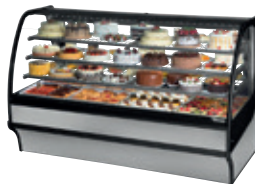
TDM-R-77-GE/GE-S-S *NEW True Display Merchandisers