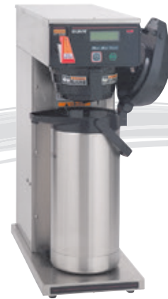
AXIOM-DV-APS Automatic Airtop Brewer