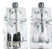
Chaumont Mills 11cm - 4.5in Pepper 940211, Salt 940211/SME