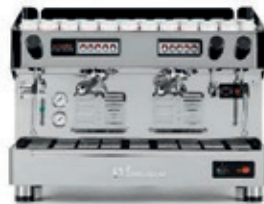
2Gr Compact shown