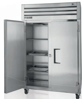
STG2R-2S True's Spec Series accommodate full size sheet pans.