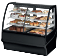
TDM-DZ-48-GE/GE-B-W *NEW True Display Merchandisers