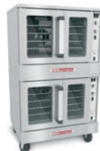
Double Deck BES/27SC