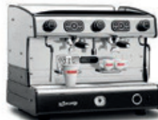
S2 - Tall 2 Group shown