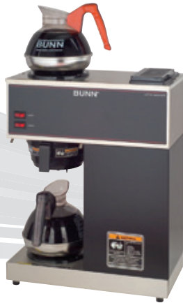
VPR-B Pourover Coffee Brewer