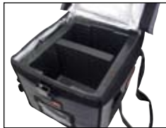
9G40 Divider for 9F15 allows separation within carrier between hot and cold food storage and reduces risk of cross-contamination.

COMMERCIAL-GRADE NYLON EXTERIOR Strong (840 denier) nylon surrounds and protects the inner layers.