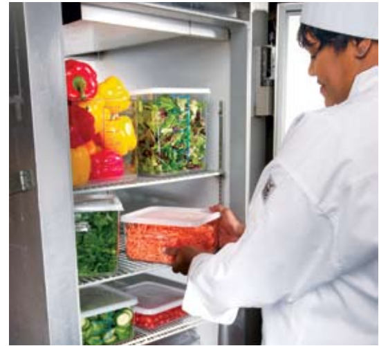
Polycarbonate Square Storage Containers