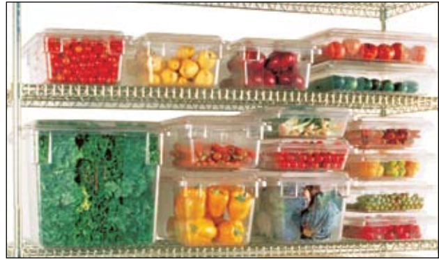
Polycarbonate Food Boxes provide clear view of contents.